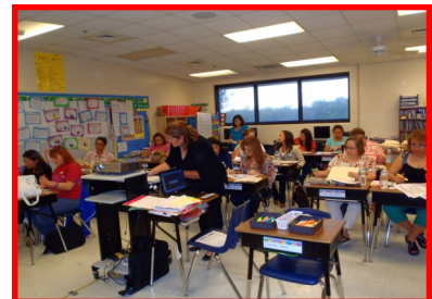
Response to Intervention presentation by Pace Specialists