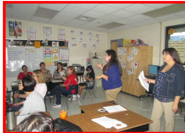
Lopez Teacher Specialists presenting on Literacy Centers