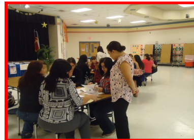
Rivera Specialists engaging the audience in Literature Circles