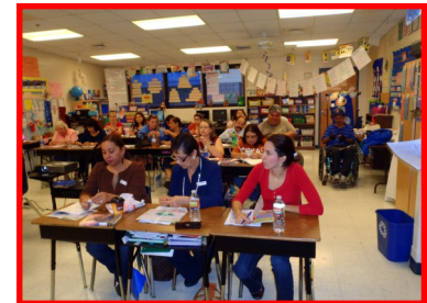
Veterans Teacher Specialists presenting Go Figure 19!