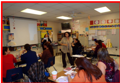
Porter Specialist discussing Elementary Writing strategies